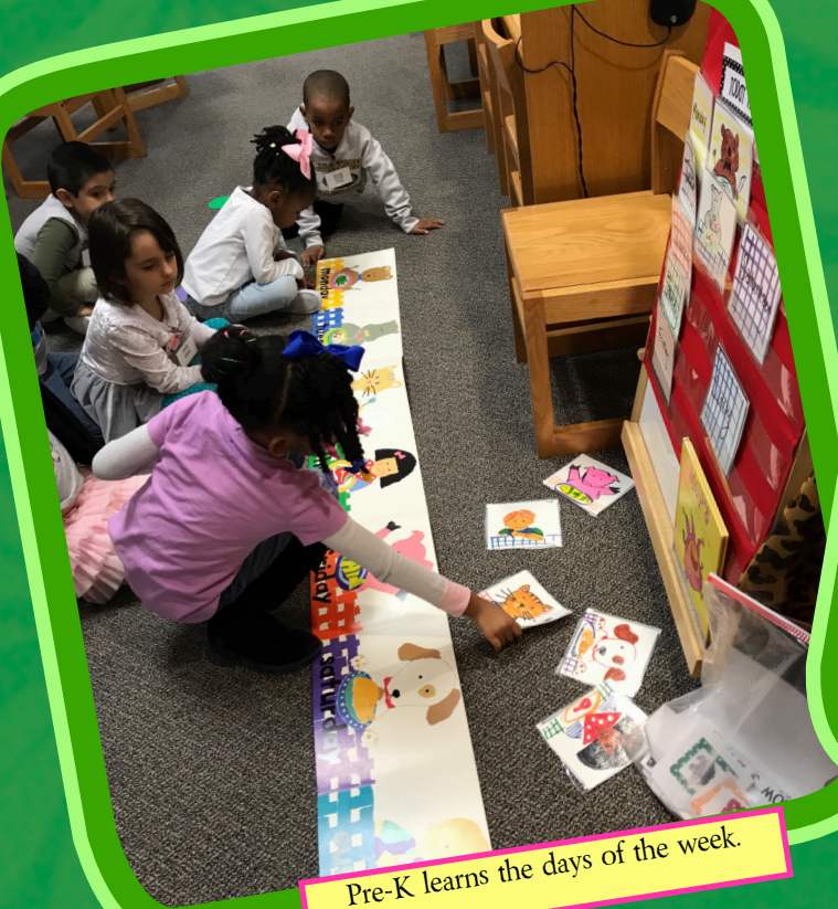
Pre-K learns the days of the week.