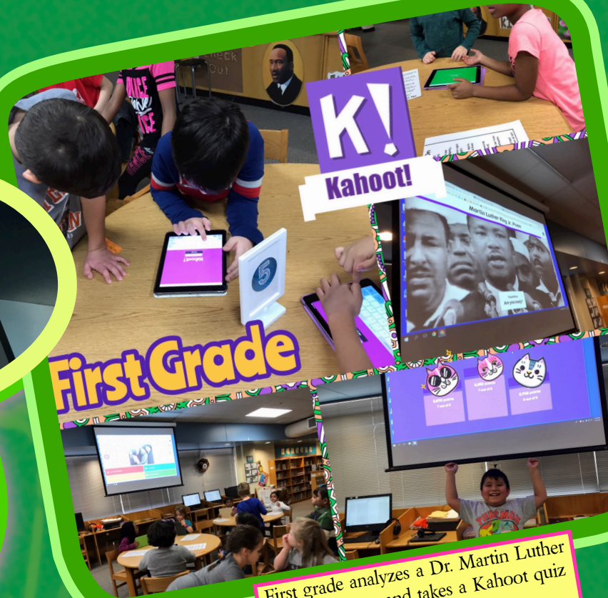
First grade analyzes a Dr. Martin Luther King Jr. poem and takes a Kahoot! quiz with the iPads.